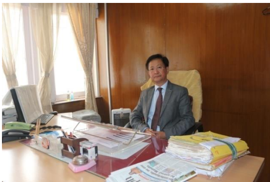
(Shri Sonam Y. Lepcha) Hon'ble Member-I, SPSC