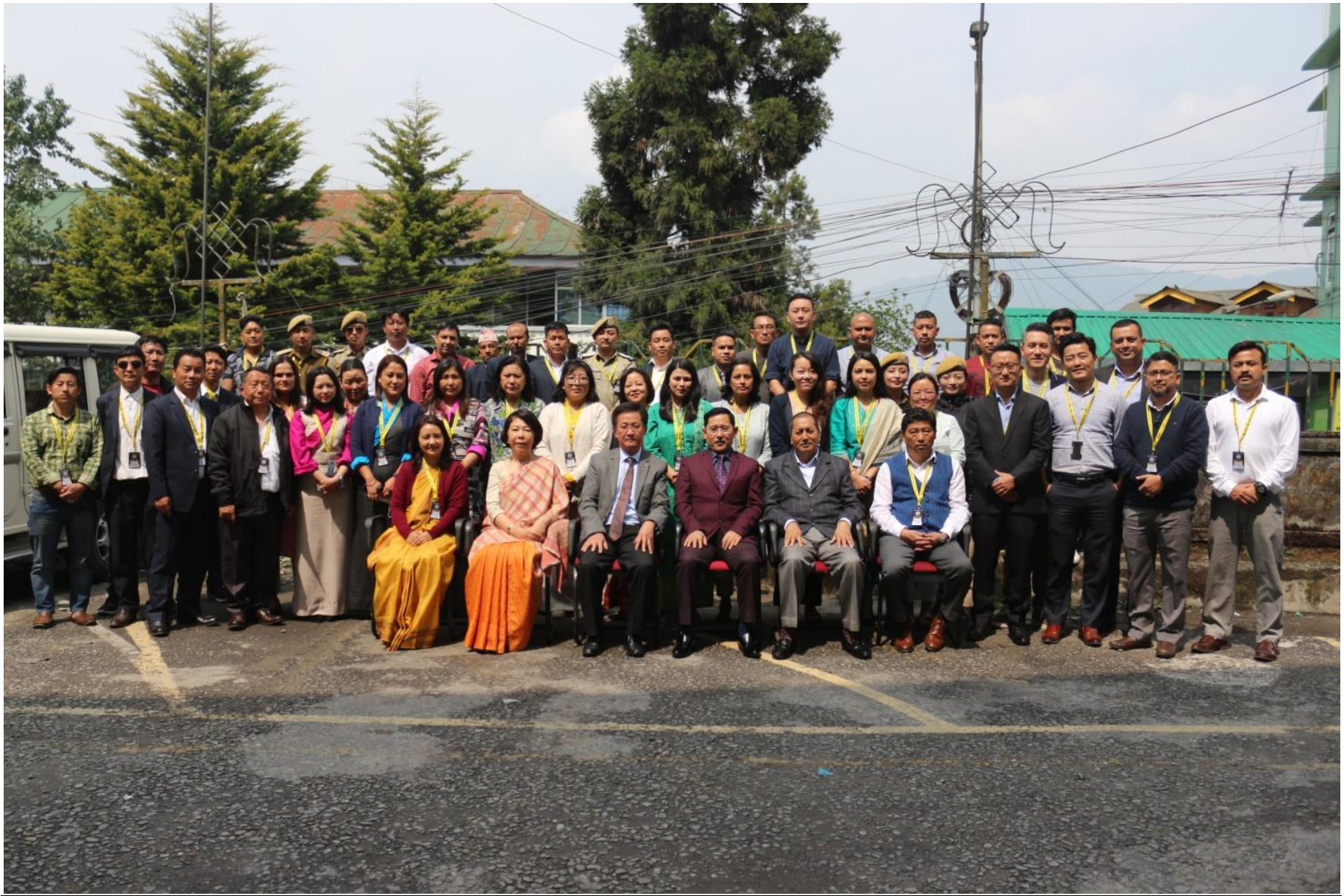
Group Photograph of Hon'ble Chairman, Member(s) and Officers & Staff of Sikkim Public Service Commission.