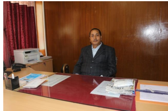
Shri Kul Bahadur Chettri (Pant) Hon'ble Member-II, SPSC